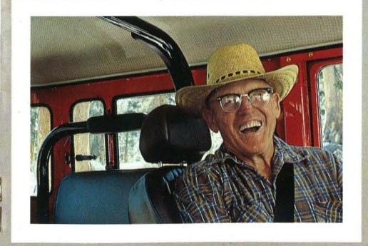
When you do a lot of driving over rough terrain like I do, you really appreciate the added protection of this steel roll bar. And I also like this extra touch of built-in comfort ...flip-out rear windows that help increase ventilation.