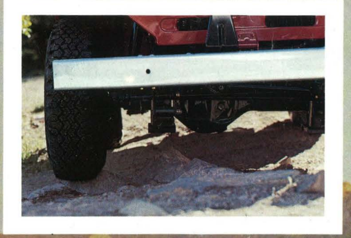
With its rugged, durable four wheel drive and H78x15 4-ply rated tires, this Land Cruiser has about as much traction as a mountain goat. And I need it to get to my favorite fishing holes. (Hardtop shown with optional mud and snow tires.)