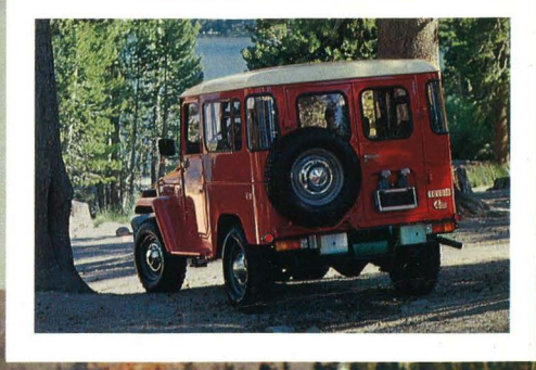
You know why I drive a Land Cruiser? It's dependable. And it came with a lot of standard features like a 125-horsepower, 4.2 liter overhead valve engine, power-assisted front disc brakes, steel skid plates, all included in the base sticker price.